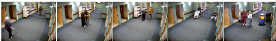
Figure 2. Examples of interaction patterns in a nursing home.

Social interaction plays an important role in our daily lives. It is one of the most important indicators of physical or mental impairment of aging patients. We conducted a “Wizard of Oz” study on the feasibility of detecting social interaction with sensors in skilled nursing facilities. Our study explored statistical models that could be constructed to monitor and analyze social interactions among aging patients and nurses. We were also interested in identifying sensors that might be most useful in interaction detection; and determining how robustly the detection can be performed with noisy sensors.